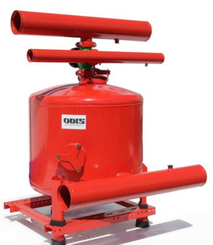
Single filter mounted on skid