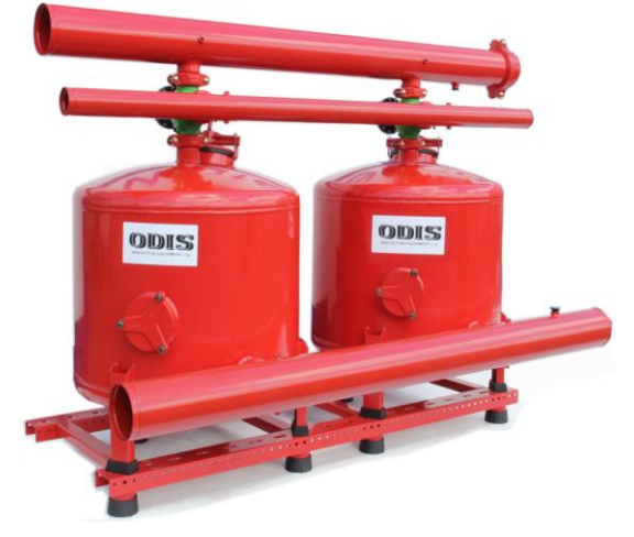
Two filters mounted on skid